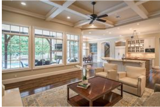
The kitchen and family room are open allowing you and your family or guests to mingle, never leaving anyone on their own.