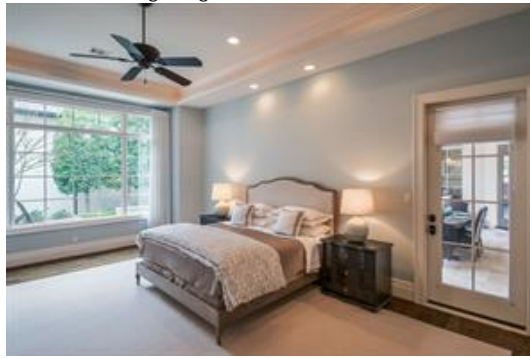
Step into the master suite, with the soothing paint color, reading lights above the bed, and your private door to the outdoor living area.