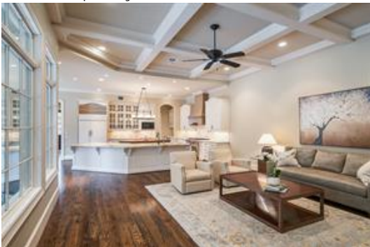
Many homes lack in wall space for your art work....not this home!