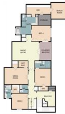
The second floor layout.