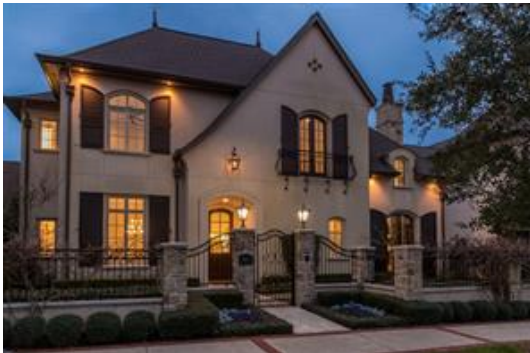
Beautifully appointed home in The Woodlands Garden District, East Shore! Character, charm, timeless are words that describe this home....come and take a peak for yourself!

Finance Considered: Cash Sale, Conventional Maintenance Fee: Mandatory/$2,930/Annually Other Mand Fee: Yes/175/Transfer Fee Tax Rate: 2.2259 Taxes w/o Exempt: $48,199/2017