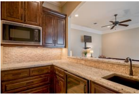
The wet bar is complete with a microwave, beverage cooler, beautiful granite counters, and richly stained cabinets.