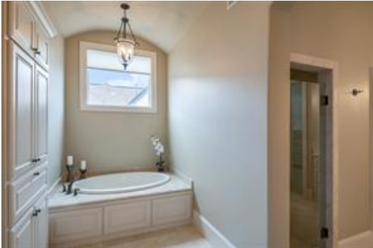
This is the beginning of the second master bath....ready to relax in the tub?