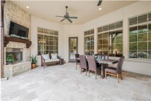
How about a ball game on the outdoor TV or roasting marshmallows for S'mores?