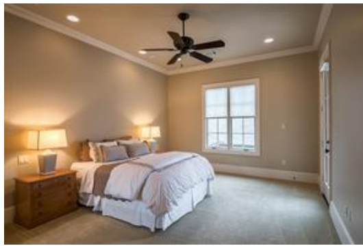
The second master suite upstairs is quite spacious! The door on the right leads to the balcony.