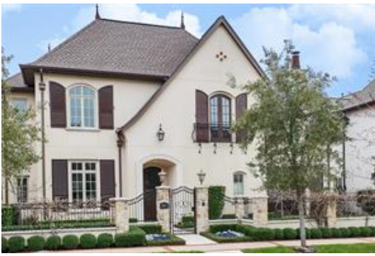
Nestled behind the iron fence with stone columns, this home is very attractive from the street. There is wisteria on the iron fence that will soon be full of leaves and blossoms.