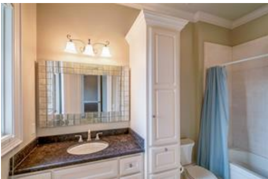
This private bath is finished nicely with granite, framed mirror and a window for natural light