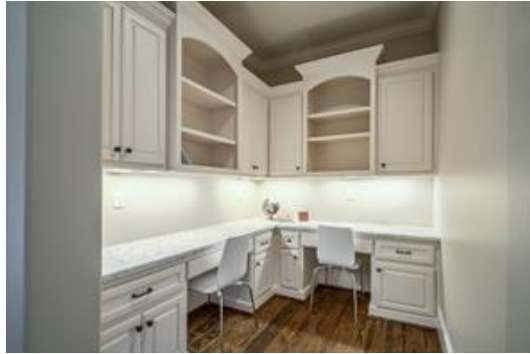
This study area is located upstairs, and there is a second planning area downstairs just outside the utility room....a good spot for meal planning!