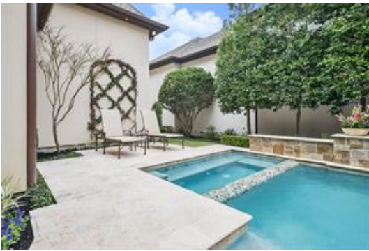
This spa will easily seat 4-6, yet is cozy enough for 2! The water flows over the rock wall into the pool.