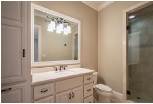
This is the bath for the previous bedroom, including a shower with frameless door.