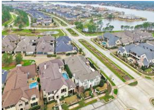
This picture captures the immediate area, and the close proximity to Lake Woodlands! Many residents comment how beautiful this neighborhood is with it's manicured medians, parks and sidewalks for taking walks and one of the reasons they have fallen in love with East Shore. 24 hour roaming security patrols too...