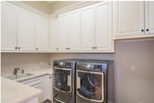
There are 2 utility rooms too! This is the one downstairs, and there is a utility closet upstairs that house stackable washer and dryer...are you getting the sense that everything comes in "twos" in this home!