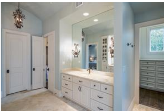
There are 2 closets, each with chests built in.