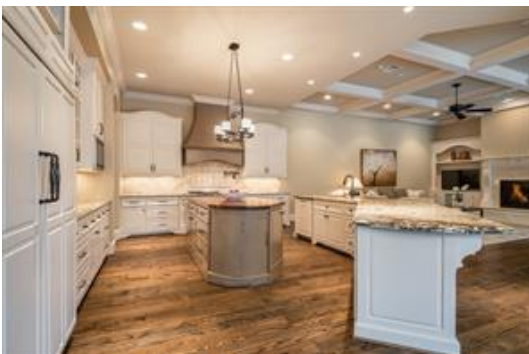
Complete with Sub Zero refrigerator and Wolf cooking units, meeting the chef in the family's needs. The abundance of granite counter space is perfect for all your culinary projects!