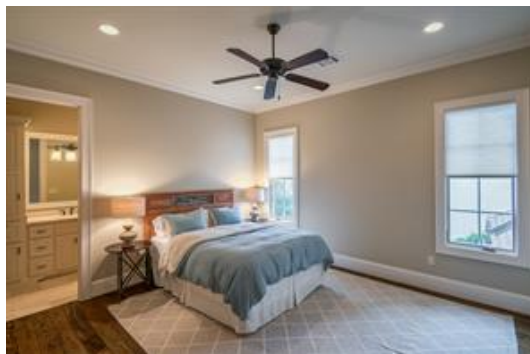
Another secondary bedroom with its own ensuite bath....richly stained hardwood floors and windows looking to the pool area.