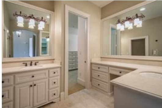
The master bath continues with the double marble vanities and full shower. The travertine floors finish this room...extraordinary finishes for an extraordinary home!