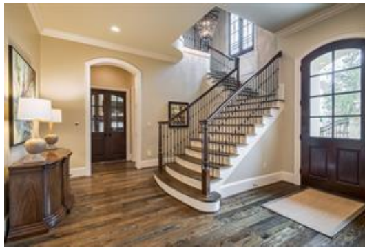
The foyer of the home has a feeling of home.... warm wood floors and wood steps with stone risers on the staircase. The home's elevator is located just past the doorway leading to the study. BTW, this home is equipped with central vac, wired for surround sound, and has a warranty for termites.