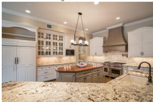
Glass front cabinets to house your special tableware, marble back splash, and to ease filling pasta pots with water, the pot filler at the cooking unit is a must!