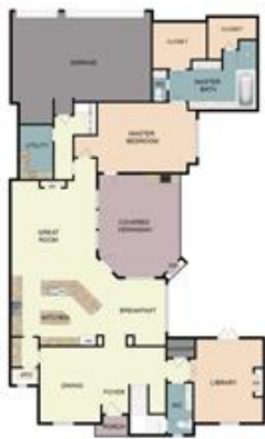
The first floor layout.