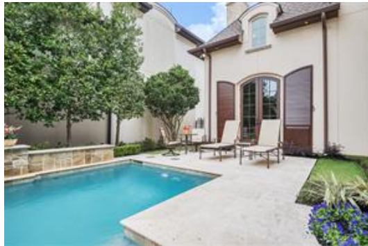
The pool is very private, surrounded by the home. The doors you can see are leading to the study.