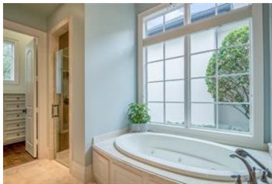
This is truly a garden Jacuzzi tub, and the nearby shower is finished with travertine and frameless enclosure.