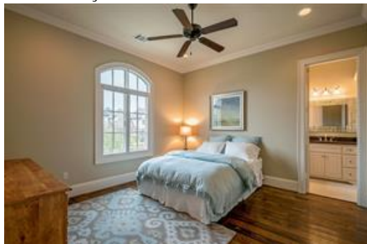
This secondary bedroom is located at the top of the stairs, and the window looks to the front garden. Warmly stained wood floors and an ensuite bath.