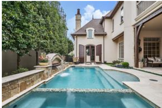
This refreshing Ozone pool was designed and built by Custom Pool Concepts in 2012...enjoy year round! Surrounded by a beautiful travertine deck...for an elegant look.