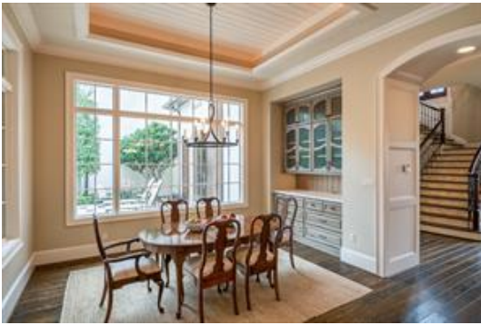
You will never run out of space with so much storage! Sur La Table, here I come!