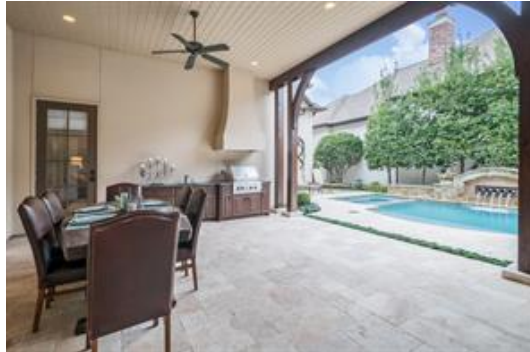
This outdoor living area is a nice extension of the house....gather your friends and family and be ready to enjoy! Are you ready to enjoy the benefits of living in an "up front" location, with an East Shore address? Come fall in love with this home and East Shore, you will be delighted you did!