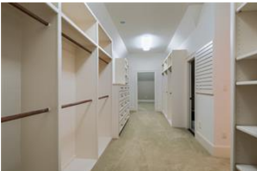
Look at the size of this second master suite's closet! Unbelievable! The door at the end leads to another storage space, and the door on the right to the Texas basement.