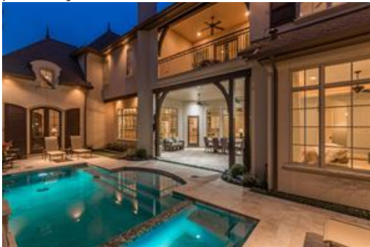
The pool and home become one with all of these windows! Imagine laying on a float, gazing up at the stars and moon, letting your cares just float away....