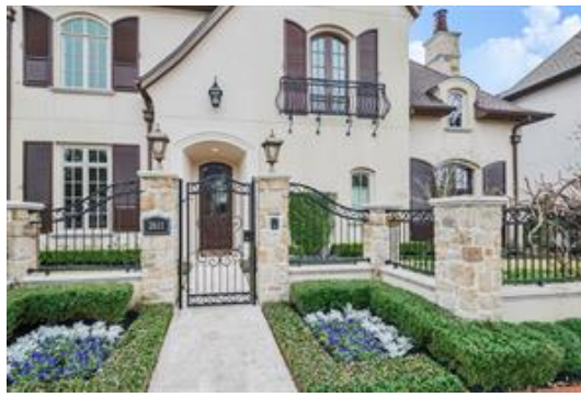
East Shore has its own private club house, pool with spa, kitchen, locker rooms, gym equipment and exercise classes! It is also available for private parties! The tour starts here, enter through the gate, and front door.....