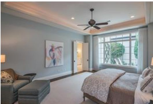
The master suite offers a large window overlooking the gardens. For quieter moments, the indirect lighting is perfect.