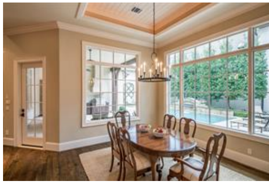
Coffee, breakfast or family dinners are surrounded by windows with views to the outdoor patio and pool area. Notice the wood paneled tray ceiling, complete with indirect lighting.