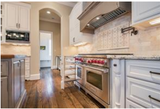
This Wolf cooking unit has 6 burners and a griddle, 2 ovens, vent hood, and the pull out spice racks on either side come in very handy!