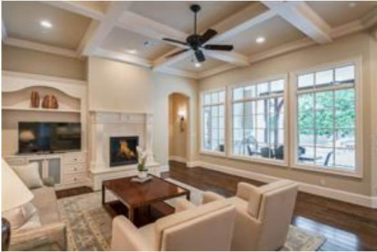
This family room is located in the center of the home, offering the views of the pool. Notice the coffered ceiling, solid wood floors, gas log fireplace with a built in to the side. The doorway at the back of this room leads to the master suite, tucked away for the ultimate in privacy.