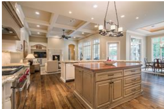
The kitchen island has a mahogany counter, and free of cooktops or sinks, allowing it to be a fabulous work space or for serving food at your larger gatherings. Notice the bank of drawers, so convenient for storage!