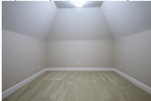
Did someone say they need storage????