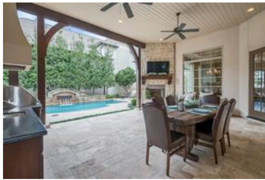
Saving one of the best features for last! This outside living space is the spot for outdoor entertaining! There is an outdoor kitchen with grill and sink. The cedar beams accent the opening and the wood paneled ceiling is a nice added touch! With the fireplace, this space is good for year round use!