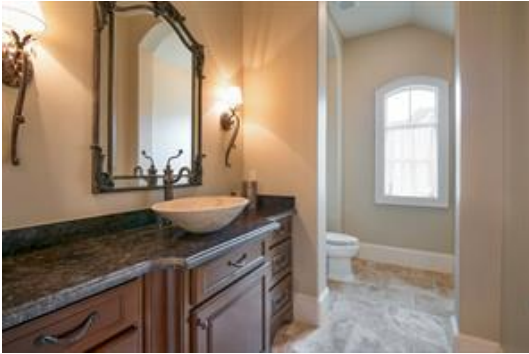
There are 2 powder rooms, this is the one downstairs.