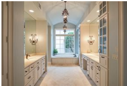
The barrel ceiling in this master bath leads you directly to the tub....with vanities on each side, full mirrors, beautiful light fixtures, and marble counters and floors!