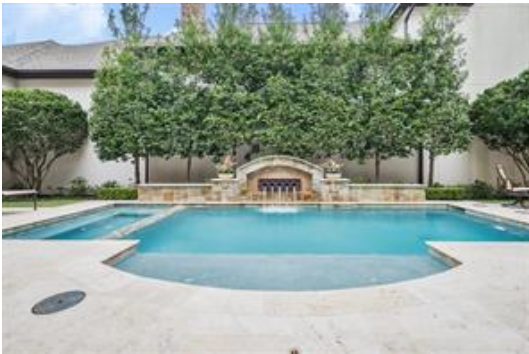
What a gorgeous pool! The travertine coping and deck are so tasteful! The pool ranges from about 3.5 to 5 feet deep.